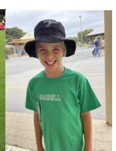
all smiles, friendships and dress ups